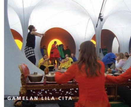
GAMELAN LILA CITA

Every day from Monday to Friday there will be workshops in colour, light and music given by the Colourscape artists, musicians and performers. These workshops will cover a range of topics exploring the scientific nature of colour and light as well as art and music. If you would like to bring a group to participate in the workshop week please ring the festival telephone number to check availability. Workshops cost £3 per student for a one-hour session or £5.50 for a full morning or afternoon.